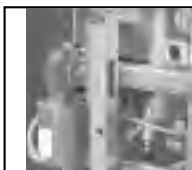
Four-stage washing process provides pre-wash, power wash and final rinse all in a 66" machine.