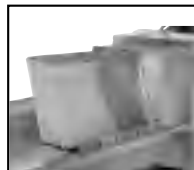
Large 19" high opening accommodates larger items and utensils.