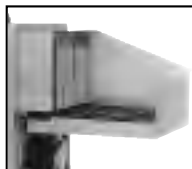
Easy to remove wash arms with captive end caps. Never lose another end cap again!