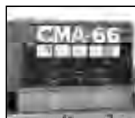
Top mounted controls include easy to read temperature gauges and complete operating instructions.