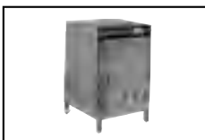
Optional pedestal allows the L-1X16 to be raised up to a full 12" off the floor for easy operator use. Height adjustable from 8" to 12".