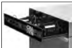
Convenient to service "Works-in-a-drawer", may be removed by unplugging one electrical connection.