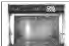
Upper and lower rotating wash arms guarantee excellent results.