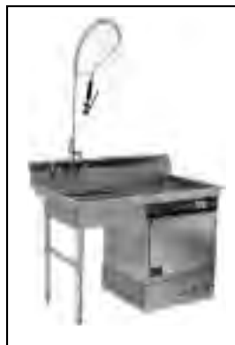
Optional dishtable, faucet and pre-rinse unit sold separately.