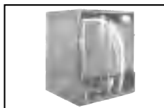
Pumped drain will drain uphill. Requires no floor drain.